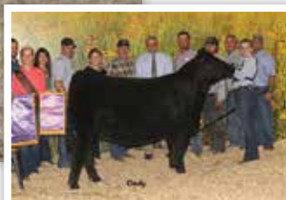
DAMERON NORTHERN MISS 8153 The $100,000 dam of Lot 16.