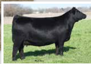
DAMERON C5 NORTHERN MISS 1406 The $137,000 valued dam to Lot 10.