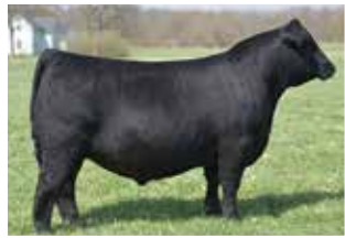
DAMERON VIROQUA Sire of Lots 20-22