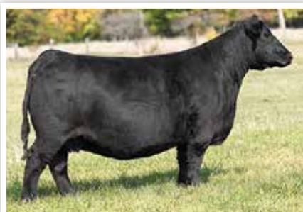
DAMERON NORTHERN MISS 4303 Dam of Lots 7-9.