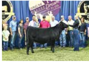
DAMERON KRAMERS NELLIE 7041 Dam of Lots 13-15.