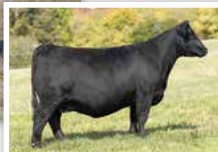
DAMERON FRONTIER GAL 645 Dam of Lots 4-6