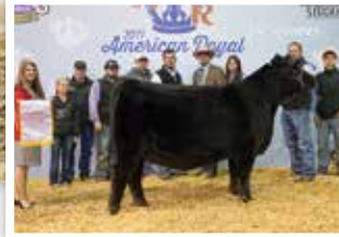
DAMERON PRIMROSE 659 Dam of Lots 23-26.