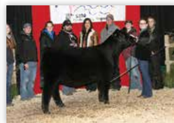
DAMERON NORTHERN MISS 9143 — 2020 Grand Champion Owned Female MAJAC and Maternal Sister to Lots 17 and 18.