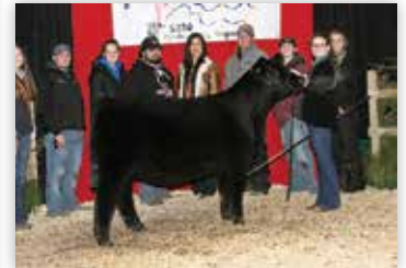
DAMERON NORTHERN MISS 9143 — The 2020 MAJAC Grand Champion and full sister to the dam of Lot 29.