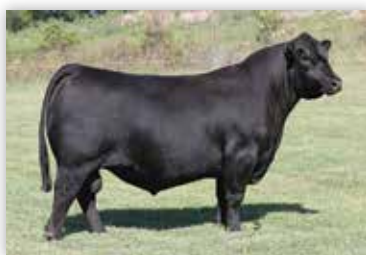
STEVENSON TURNING POINT