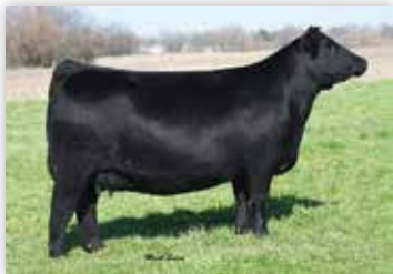
DAMERON NORTHERN MISS 1406 — The $137,000 full sister to the dam of Lot 19.