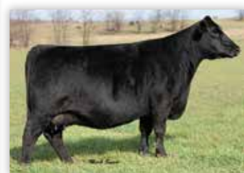
DAMERON NORTHERN MISS 3114 — Dam of Lots 54 and 55.