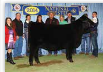
DAMERON BLACKBIRD 2161 — Maternal sister to Lots 58 and 59.