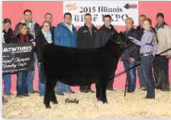
DAMERON LUCY 4137 — IL Beef Expo Supreme Champion and Full Sister to Dam of Lot 7.