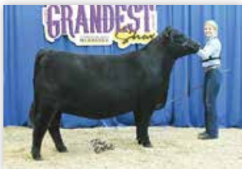
DAMERON NORTHERN MISS 9203 — The 2020-2021 ROV Sr. Show Heifer of the Year and dam of Lot 8.