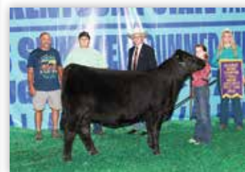
DAMERON NORTHERN MISS 2169 — The 2023 Res. Grand Champion Female of the Kentucky State Fair and maternal sister to Lots 9-12.