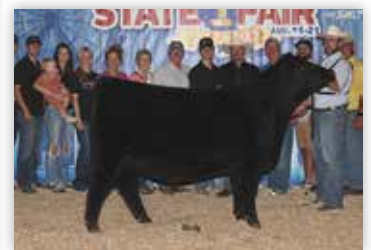
DAMERON C-5 BEAUTY 2110 — The 2022 Grand Champion Female of the IL State Fair and maternal sister to Lots 33 and 34.