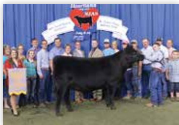
DDA BARBARA 1308 — Granddam of Lot 56.