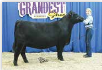
DAMERON NORTHERN MISS 9203 — The 2020-2021 ROV Sr. Show Heifer of the Year and maternal sister to Lot 15.