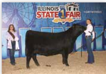
DAMERON LUCY 9213 — Dam of Lot 31.

• This direct daughter of BNWZ Dignity stems back to Dameron Lucy 9213, a past and many-time champion back to the Supreme Champion at the Illinois Beef Expo, Dameron Lucy 4137, who is also more widely known as the mother of the 2021 National Junior Angus Show Grand Champion Owned Female and the 2021 Atlantic National Res. Grand Champion Female, Dameron Lucy 9193.