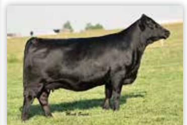
EXAR FRONTIER GAL 1447 — The $80,000 granddam of Lot 30.