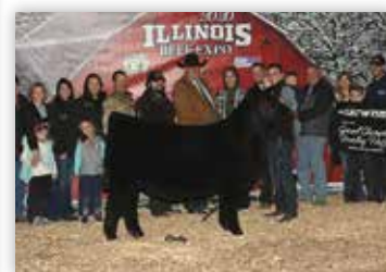
DAMERON PRIMROSE 959 — 2020 IL Beef Expo Supreme Champion and Full Sister to Lots 21 and 22.