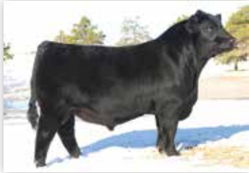
DAMERON FIRST CLASS — Full brother to the dam of Lot 27.