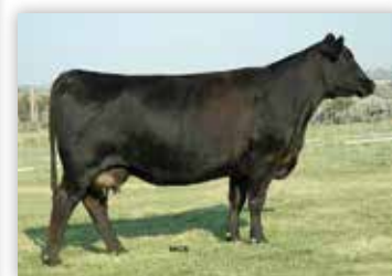
BT BLACKBIRD 194R — Dam of Lots 58 and 59.