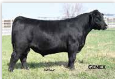
BEAR MTN BULLET PROOF