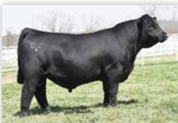
DEER VALLEY GROWTH FUND