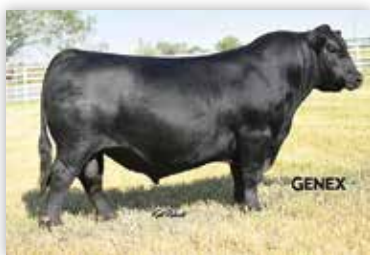
DB ICONIC G95