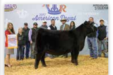
DAMERON PRIMROSE 659 — 2017 Res. Grand Champion Female. She is a full sister to Lot 50 and maternal sister to Lots 51-53.