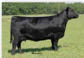
DAMERON LUCY 868 — Granddam of Lots 1-4.