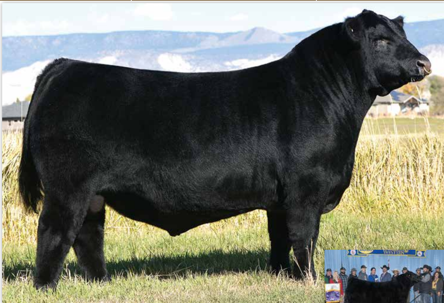
LAZY JB EGO 1428 — The 2023 NWSS Grand Champion Bull.