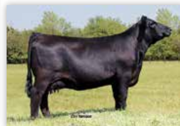
DAMERON NORTHERN MISS 0109 — Dam of Lot 14.

A top April prospect by PVF Blacklist 7077 back to Dameron Northern Miss 0109, who was the National Junior Angus Show, National Western, and Western National Angus Futurity Grand Champion Female and a full sister to the Triple Crown Winner and $306,000, Dameron First Class. Dameron Northern Miss 9143, a maternal sister, was the $73,000 selection of the Brooks family through the 2019 Focus on the Future Sale who went on to be named the 2020 MAJAC Grand Champion Owned Female. Dameron Northern Miss 947, another maternal sister, was the $100,000 top-selling female of the 2019 Focus on the Future Sale going on to be named the 2020 Illinois Junior Field Day Grand Champion and the 2020 Central Illinois Preview Show 3rd Overall Champion. Yet another maternal sister, Dameron Northern Miss 951, was the $40,000 selection of the Theis family who went on to be named the 2020 Northeast Kansas Junior Show Res. Champion Owned Female. Other maternal sisters include the 2015 Grand Champion Bred & Owned Female at the National Junior Angus Show, the Res. Grand Champion Bred & Owned Female at the MAJAC, and the 2015 Illinois State Fair Grand Champion Female.