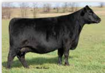
DAMERON NORTHERN MISS 3114 — Granddam of Lots 9-12.