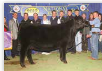
DAMERON NORTHERN MISS 0109 — Dam of Lots 17 and 18.