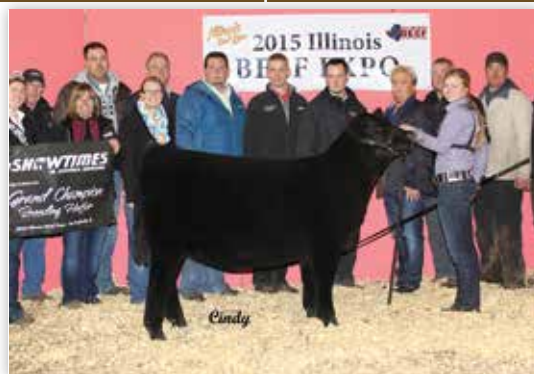
DAMERON LUCY 4137 Donor dam Lot B