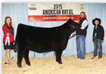
DAMERON FR SANDY 4180 — The $76,500 maternal sister to Lot 16.