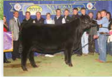
DAMERON NORTHERN MISS 0109 — Sister to Lots A1-A4.