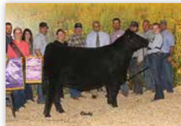
DAMERON NORTHERN MISS 8153 — The $110,000 dam of Lots 5 and 6.

This special Northern Miss attraction is by SCC SCH 24 Karat 838 back to the featured Dameron Northern Miss 8153, the $110,000 top-selling Lot 1 female of the 2018 Focus on the Future Sale and the 2019-2020 ROV Intermediate Show Heifer of the Year; she was awarded this honor by being named Summer Heifer Calf Champion at the National Western Stock Show, Grand Champion at the Central Illinois Preview Show, Division Champion at the 2020 Fort Worth Stock Show, and Division Champion at the National Western ROV and the National Western Junior Show.