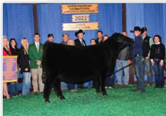
DAMERON C-5 BEAUTY 2110 Full Sister to Lot F