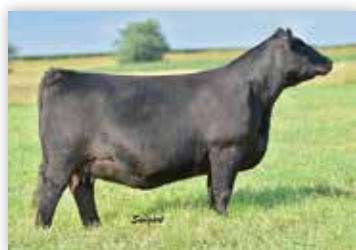
DAMERON PRIMROSE 659 — Full sister to Lot 50 and maternal sister to Lots 51-53.