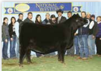
DAMERON PRIMROSE 659 — Dam of Lots 21-26.