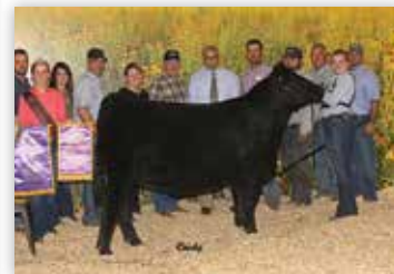
DAMERON NORTHERN MISS 8153 — Maternal sister to Lot 13.

A spectacular prospect and a phenotypic stunner by SCC SCH 24 Karat 838 back to the popular Dameron Northern Miss 4303 who is a maternal sister to the featured Dameron Northern Miss 8153, the $110,000 top-selling Lot 1 female of the 2018 Focus on the Future Sale, Dameron Northern Miss 8153, the 2019-2020 ROV Intermediate Show Heifer of the Year; she was awarded this honor by being named Summer Heifer Calf Champion at the National Western Stock Show, Grand Champion at the Central Illinois Preview Show, Division Champion at the 2020 Fort Worth Stock Show, and Division Champion at the National Western ROV and the National Western Junior Show.