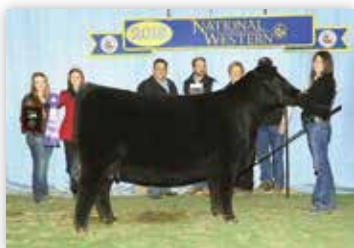
DAMERON LADY JAYE 6153 — The $65,000 maternal sister to the dam of Lot 32.