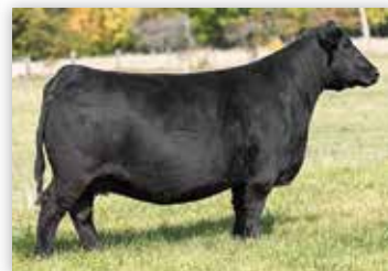
DAMERON NORTHERN MISS 4303 — Granddam of Lots 5 and 6.

A one-of-a-kind Northern Miss female by the popular Silveiras Style 9303 back to the $110,000 top-selling Lot 1 female of a past Focus on the Future Sale, Dameron Northern Miss 8153. This female's dam was the 2019-2020 ROV Intermediate Show Heifer of the Year and stems back to Dameron Northern Miss 4303, who is a full sister to the Triple Crown Winner, Dameron First Impression. Dameron Northern Miss 9203, a full sister to the dam, was the 2020-2021 ROV Senior Show Heifer of the Year. This popular pedigree is loaded with past champion and top sellers throughout the country.