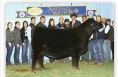
DAMERON PRIMROSE 659 — 2018 Res. Grand Champion Female of the NWSS. She is a full sister to Lot 50 and maternal sister to Lots 51-53.