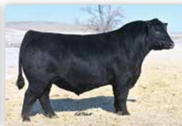
SITZ RESILIENT 10208