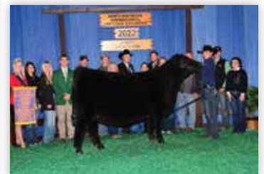
DAMERON C-5 BEAUTY 2110 — The 2022 Grand Champion Owned Female of the NAILE Jr. Show and maternal sister to Lots 33 and 34.