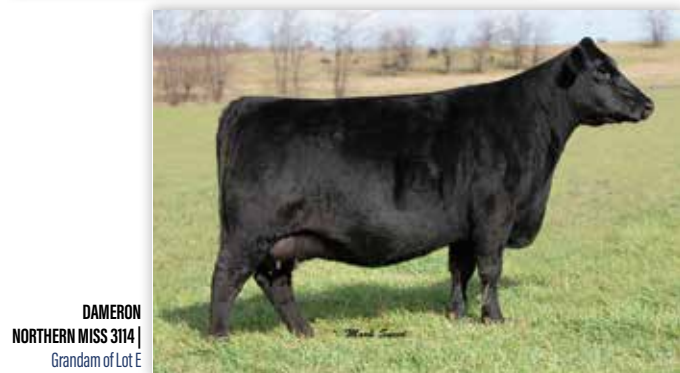
DAMERON NORTHERN MISS 3114 Grandam of Lot E