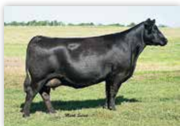
EXAR PRIMROSE 0731 — Granddam of Lots 50-53.