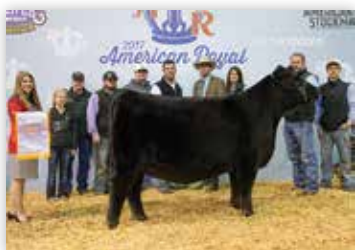
DAMERON PRIMROSE 659 — Dam of Lots 21-26.