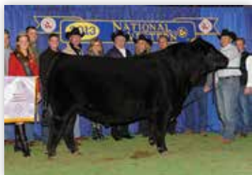
DAMERON FIRST IMPRESSION — A full brother to the dam of Lots 9-12.