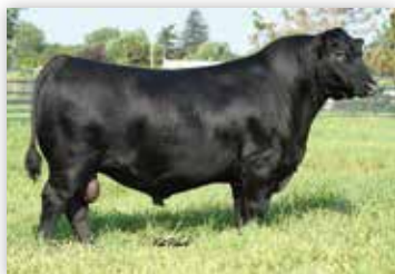
CONNEALY CRAFTSMAN — Service Sire of Lot 57.