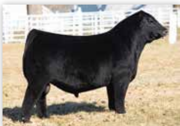
BNWZ DIGNITY 8017 — Sire of Lots 27 and 28.